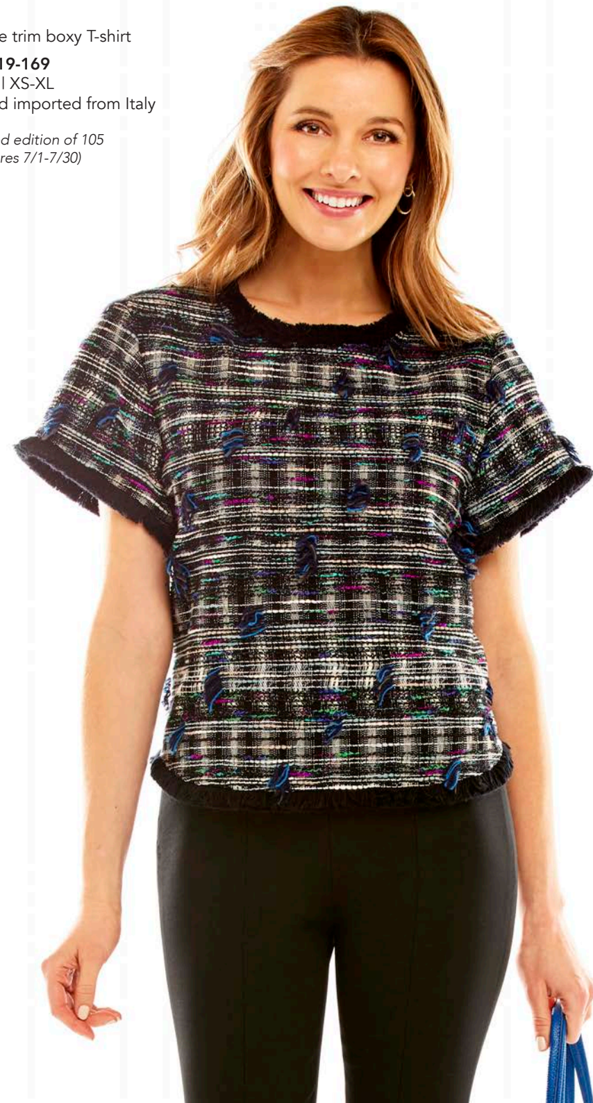
Fringe trim boxy T-shirt SC 419-169 $218 | XS-XL Tweed imported from Italy

Limited edition of 80 (In stores 7/1-7/30)