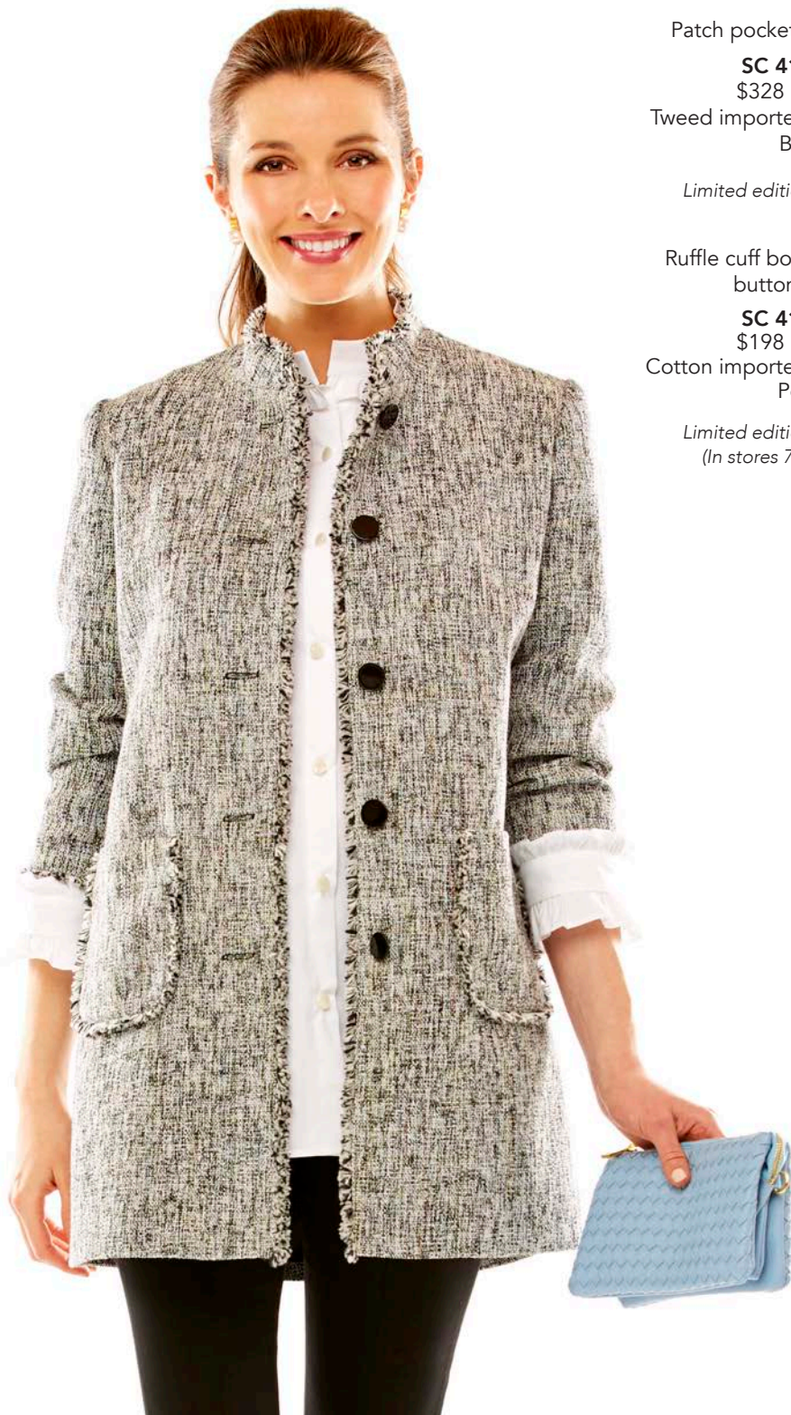
Patch pocket jacket SC 419-189 $328 | XS-XL Tweed imported from Belgium